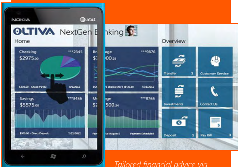
Tailored financial advice via smartphone