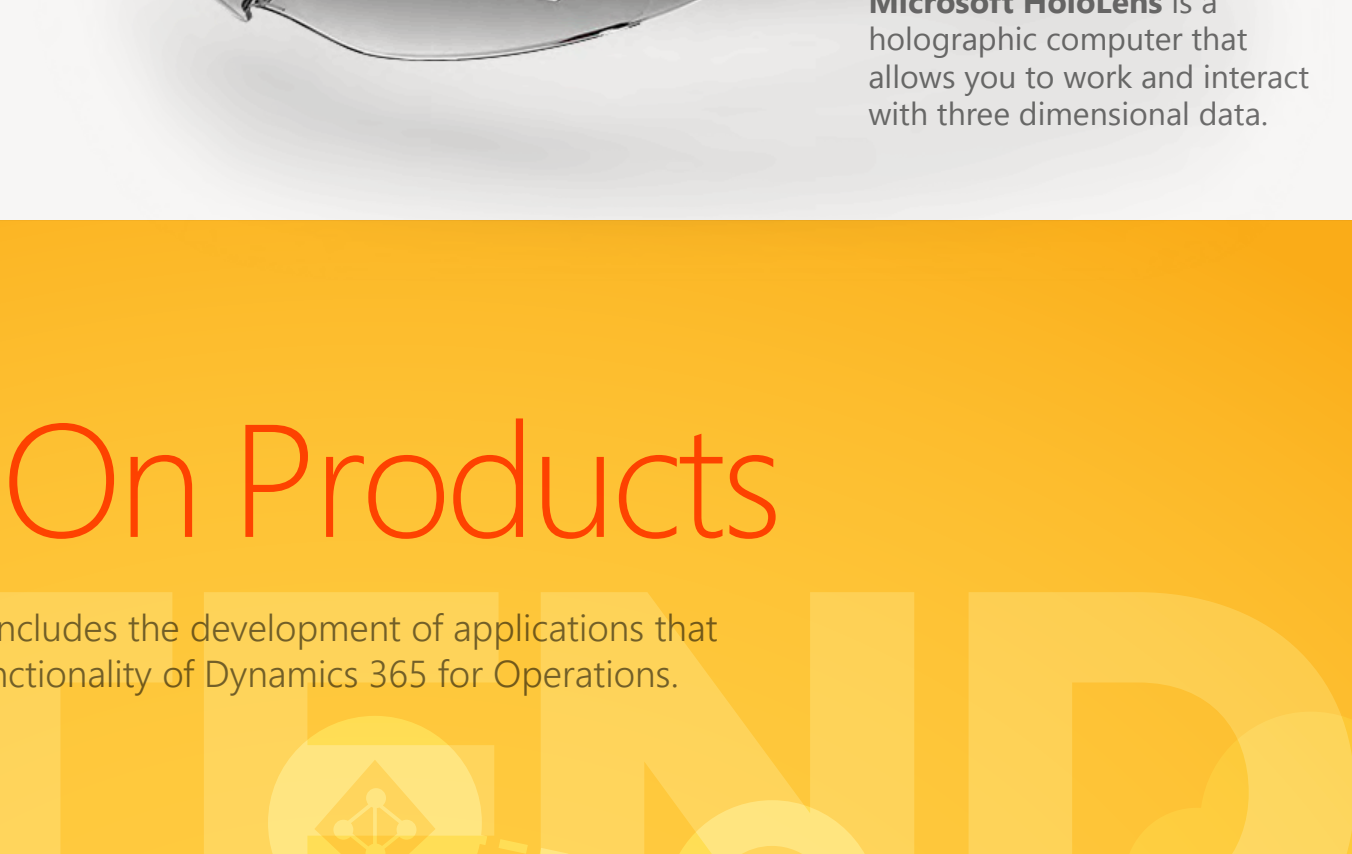
Microsoft HoloLens is a holographic computer that allows you to work and interact with three dimensional data.