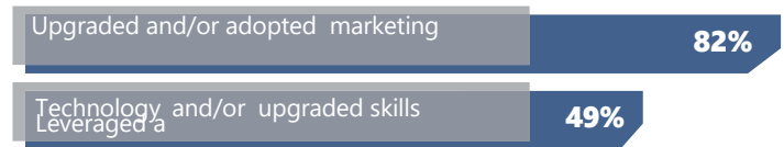
Figure 2: Analysis showing the percentage of respondents from banking and capital markets organizations who have adopted the above methods to achieve the benefits they have seen in the last 12 months; asked to respondents whose organization has seen at least one benefit in the last 12 months as a result of prioritizing the holistic customer experience (65 respondents)

Additionally, 63% report that their organization is likely to invest in customer experience management over the next year and they expect to see an 11% increase in revenue as a result.