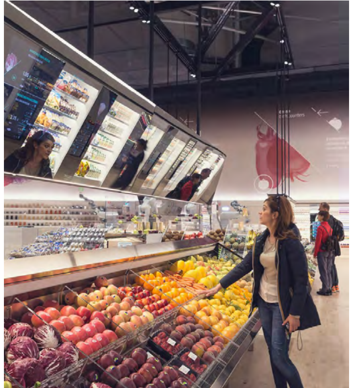
Digital augmented store at Expo Milano 2015.